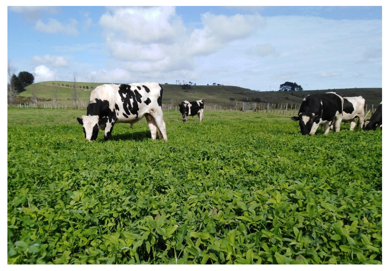
30.8.19 Two-year old bulls grazing another diversified pasture, sown April 2019, also currently dominated by annual clovers, berseem & Persian

In comparison to the slow growth from various treatments in the plot trials, some of the growth rates from whole-paddock sowings have been far stronger, e.g. two paddocks at Te Kopuru averaged 38 kg DM/ha/day for July, August and early-September: Comparing favourably to the plots at just 17 kg/ha/day.