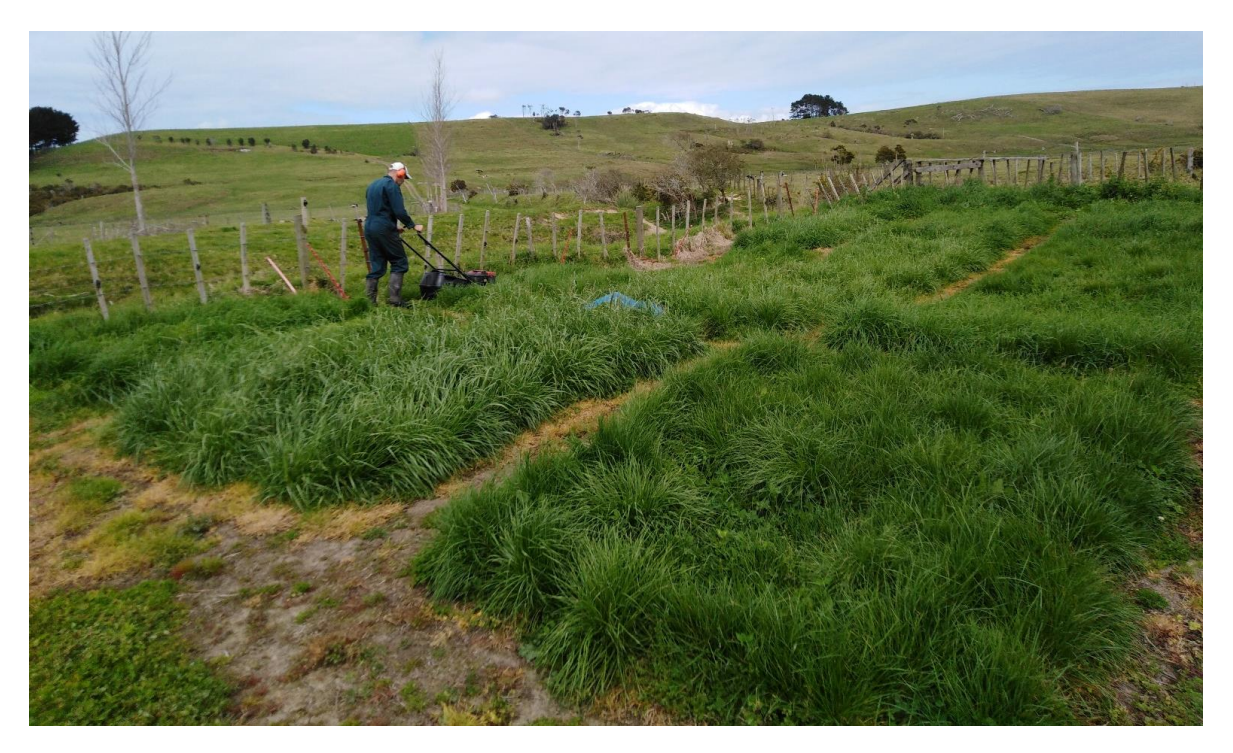
21.9.19 Mixes sown April 2018 showing strong grass & red clover growth this September